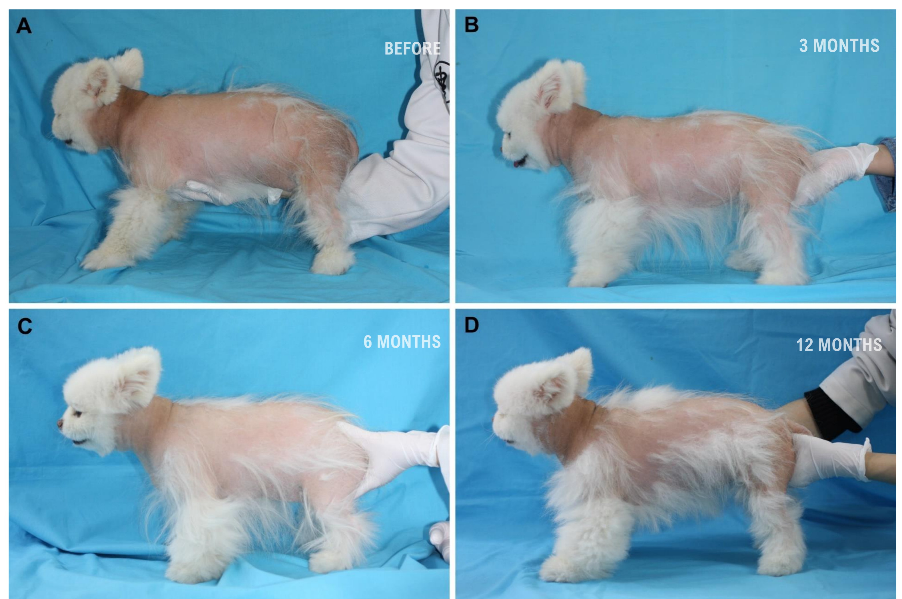
Figure 1. Pictures of case 6. Hair regrowth by more than 50% of the body after one year of treatment.

The response to treatment varied among individuals. HGAS scores improved along the trial (3M median: 2 [range: 0-14] and 6M median: 5 [range: 0-18]), and owners reported satisfaction with the products' efficacy (1M median: 2 [1-2], 6M median: 2 [1-3]) and ease of use (1M: 2 [1-2], 6M: 3 [2-3]). TEWL significantly decreased over time (mean [SD]: 0M 14.0 [8.2] g/m 2 /h and 6M 7.56 [8.3] g/m 2 /h; p=0.003), while the skin hydration increased accordingly (mean [SD]: 0M 10.9 [5.3] a.u and 6M 15.6 [9.7] a.u; p=0.02). The medications used in this study were well tolerated and none of the dogs showed any adverse reactions (figures 1 and 2).