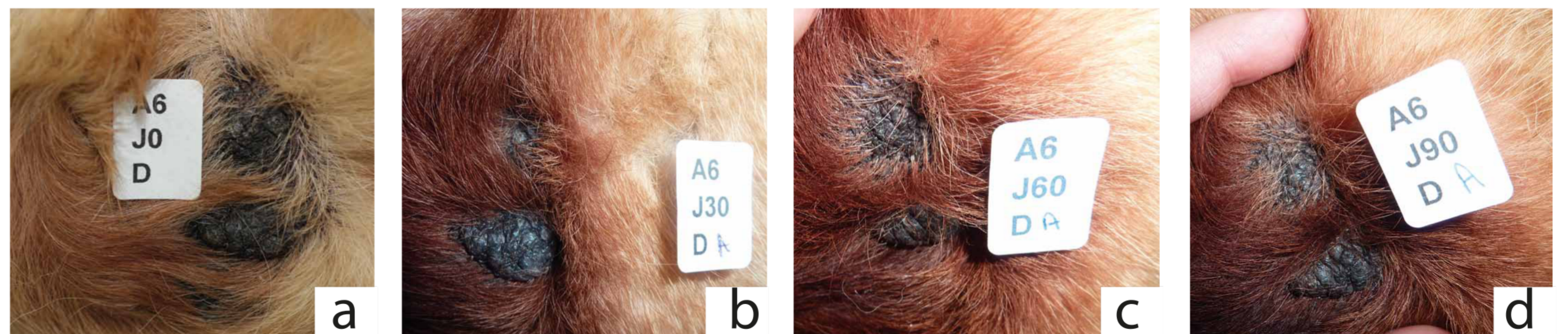
Figure 1 : Pressure point callus on the right elbow of a nine-year-old German Shepherd (case 6) over the study period - Day 0 (a); day 30 (b); day 60 (c) and day 90 (d). Lichenification and scaling scores were 4 (a); 3 (b); 2 (c); 1.5 (d) and 1 (a); 0 (b); 0 (c) 0 (d), respectively.