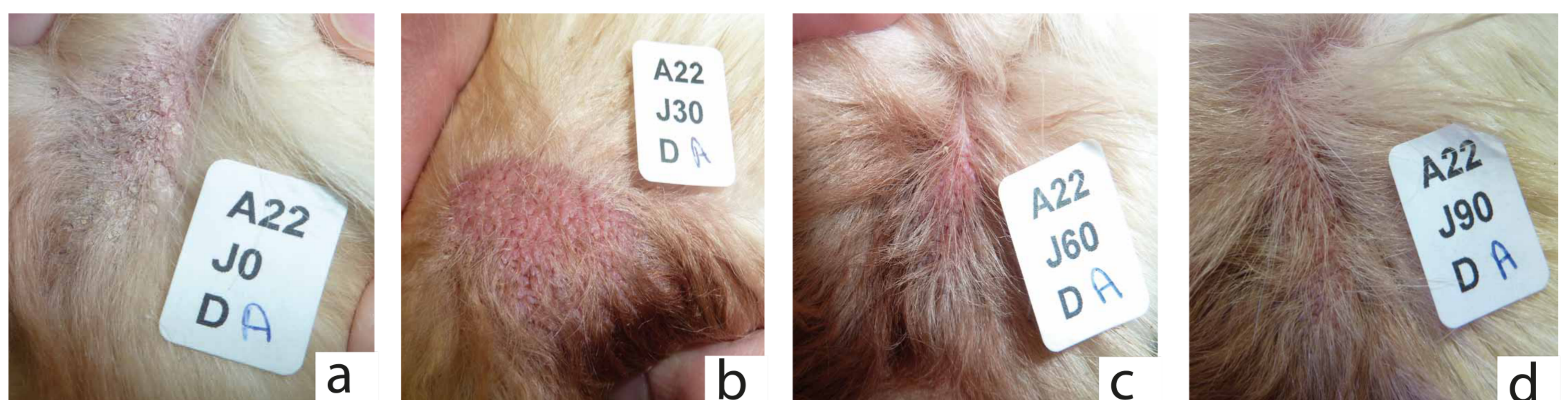
Figure 3 : Pressure point callus on the right elbow of a two-year-old Golden retriever (case 22) over the study period - Day 0 (a); day 30 (b); day 60 (c) and day 90 (d). Total affected area was 382 mm 2 (a); 407 mm 2 (b); 195 mm 2 (c); and 132 mm 2 (d).